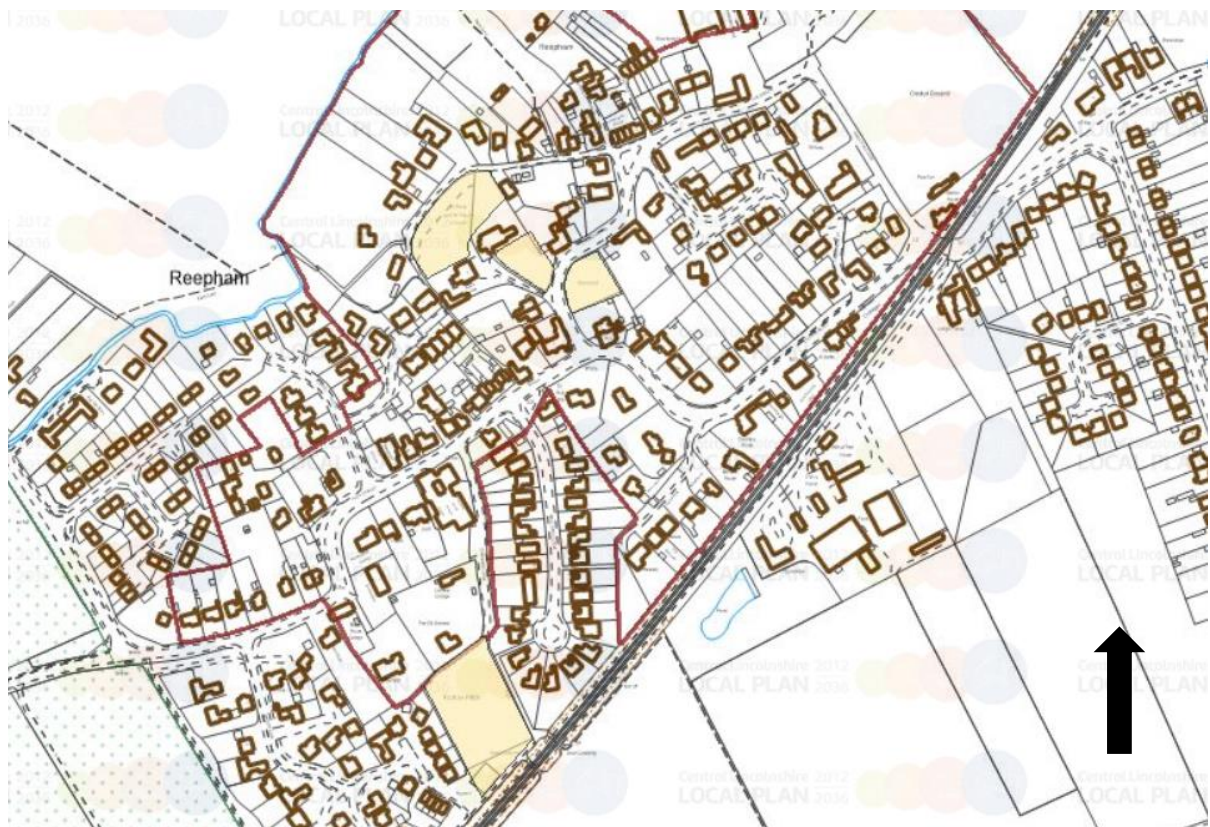
Figure 1-2: Local Green Space and Important Open Space in yellow (Policy LP23)