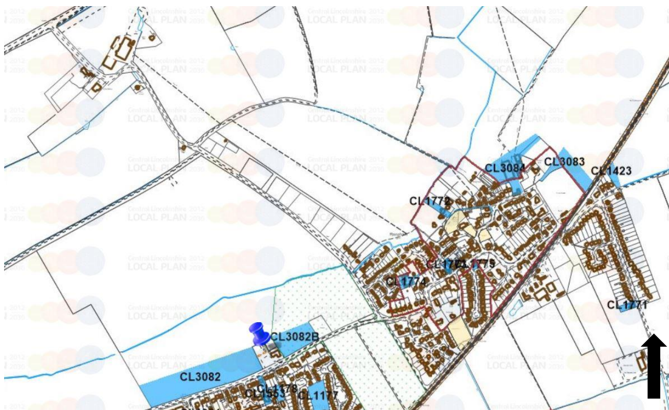
Figure 1-3: SHELAA sites (in blue) identified in Reepham parish