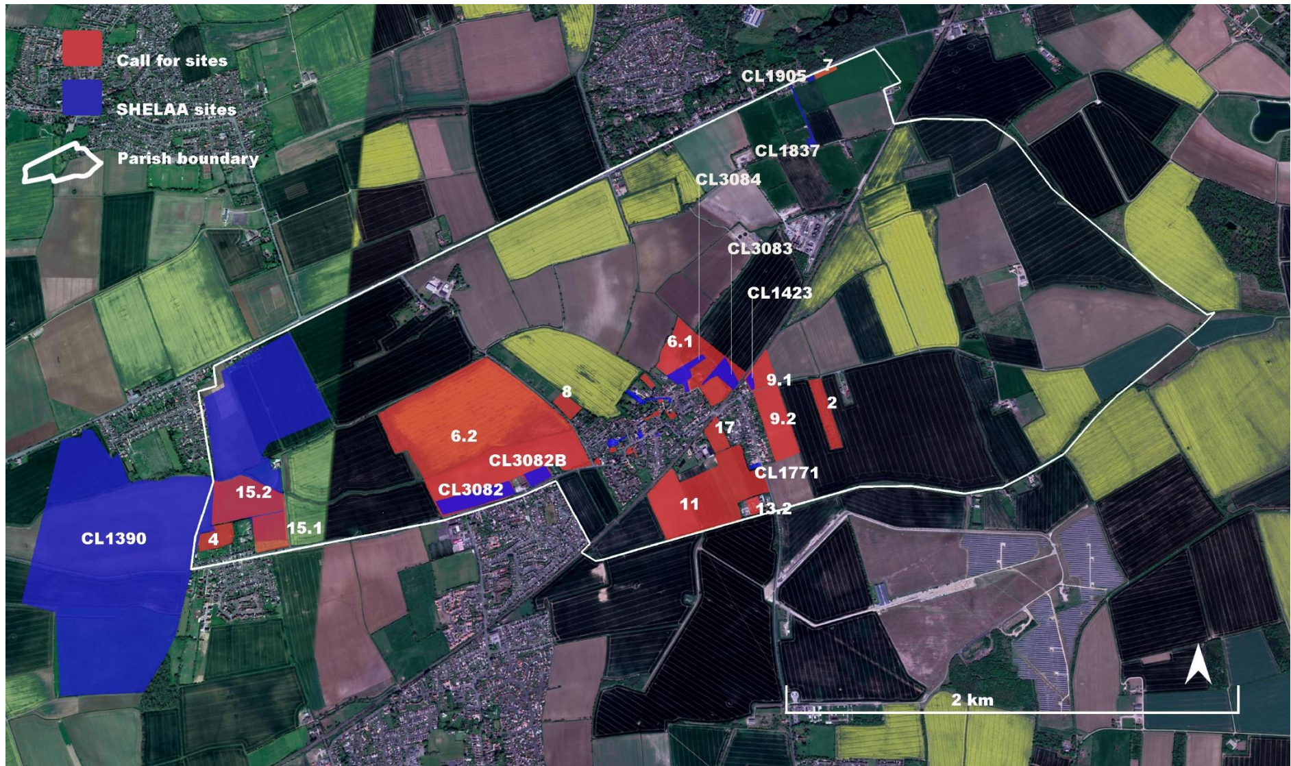
Figure 2-1: Map of all sites to be assessed through this site assessment