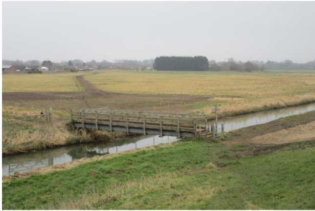
Footbridge to Fiskerton.