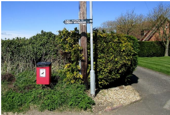
Start of path across the fields.