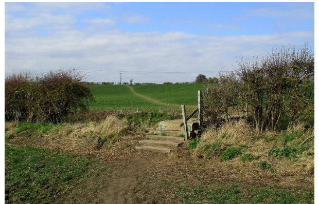
Footbridge at end of first field.