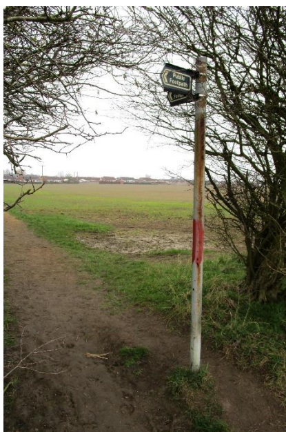
Turn left here towards Lady Meers Road