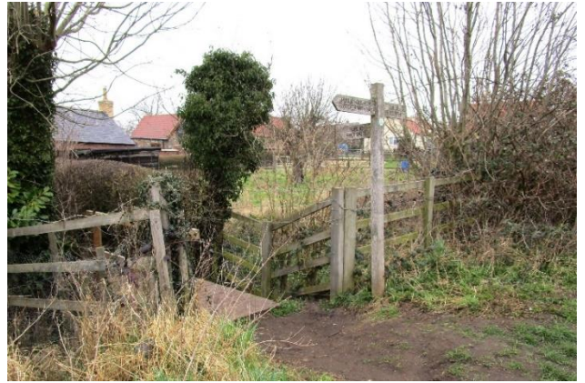
Turn left over this small footbridge.