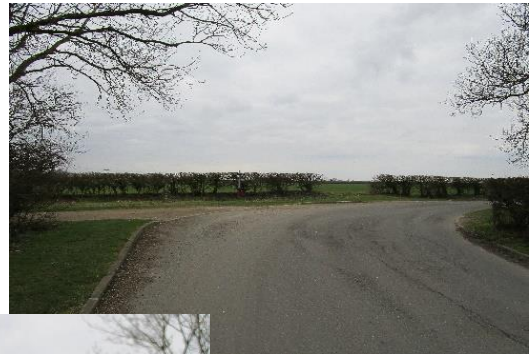
Turn left as road goes to right