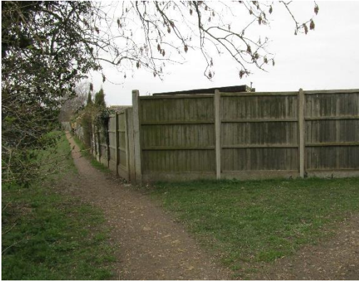
Turn left at this junction