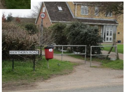
Turn left here.