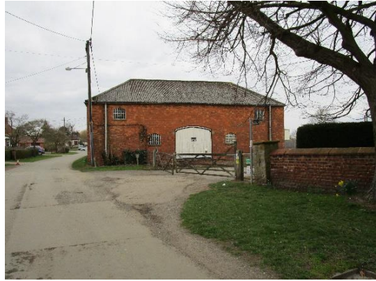
Turn right through farm yard