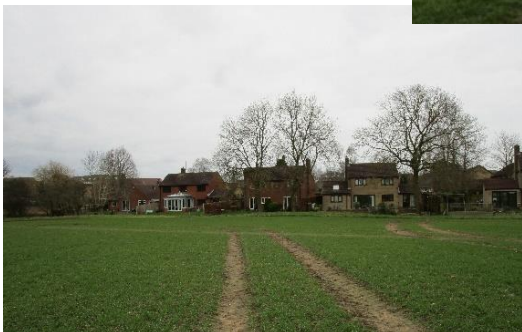
Turn right at end of this path