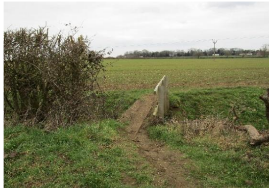
Footbridge after 2 nd field