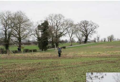
Turn left after joining road