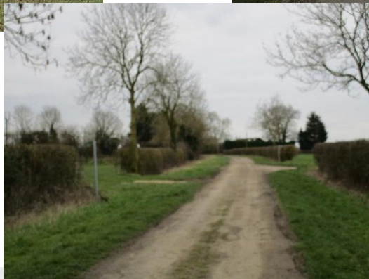
Turn left down footpath here