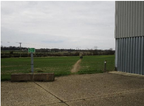
Follow the arrows across this field