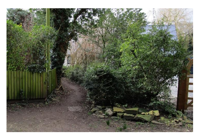
Turn right on path after no. 32