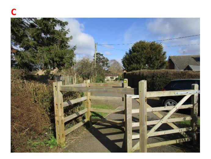
Kissing Gate, carry straight forward