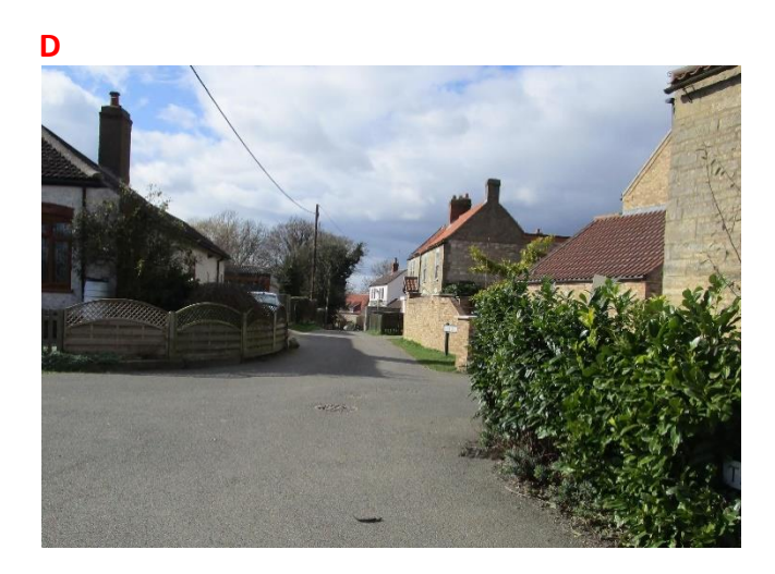
Continue to Church Lane