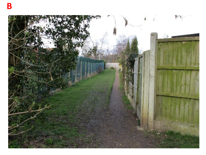
Left turn after playing field.