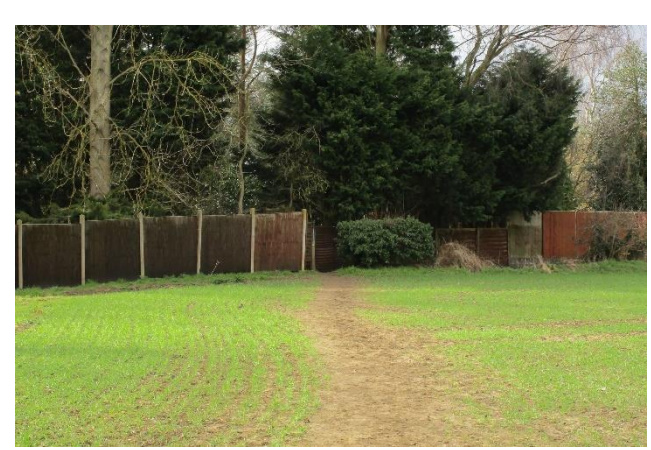
Footpath across to yellow marker, turn right.